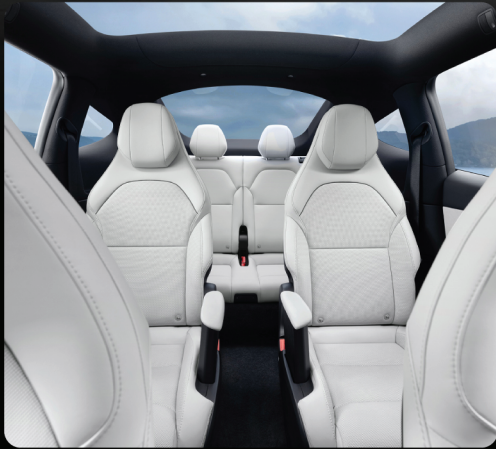
Three Rows, Six Seats