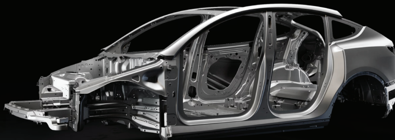
Engineered for Safety